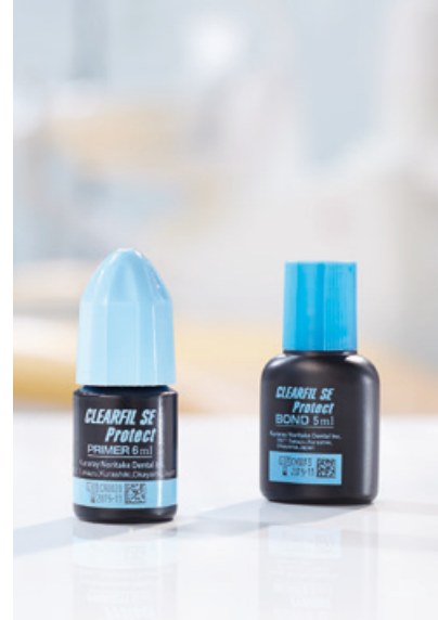
CLEARFIL™ SE Protect