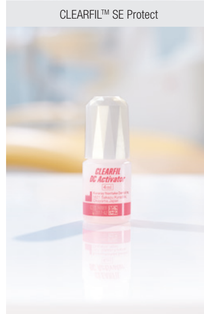
CLEARFIL™ DC Activator