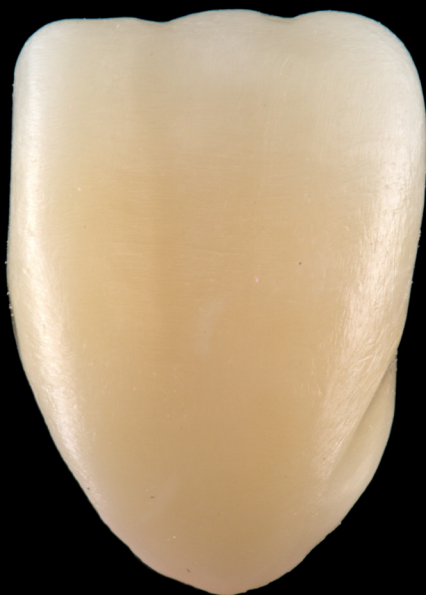
CZR™ Internal Live Stain