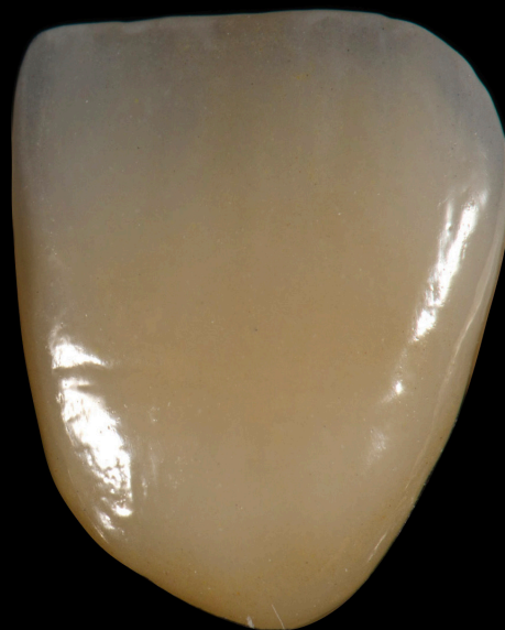
CZR™ Luster Porcelain