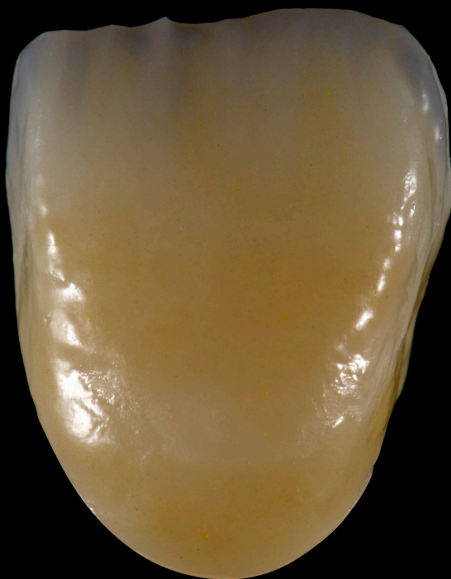
CZR™ Internal Live Stain