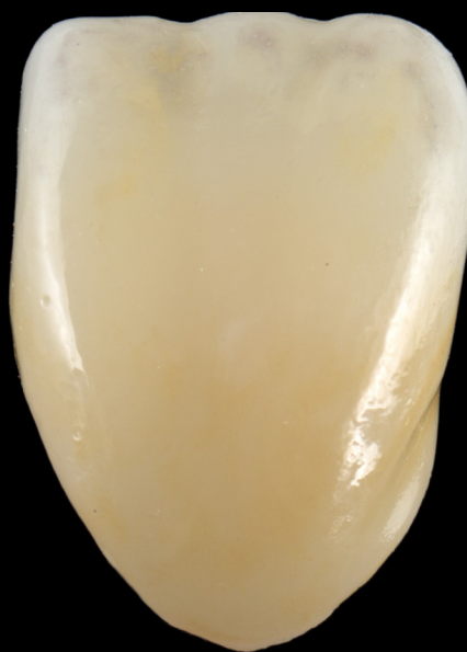
CZR™ FC Paste Stain