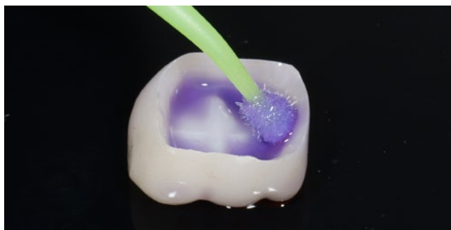
Fig. 3. Application of KATANA™ Cleaner to the restoration.