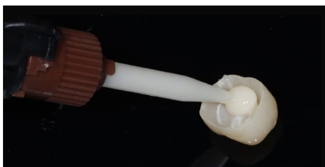
Fig. 6. The cement contains a unique silane coupling agent – the LCSi monomer – for a strong and reliable bond to lithium disilicate and other restorative materials like glass ceramics and hybrid ceramics.