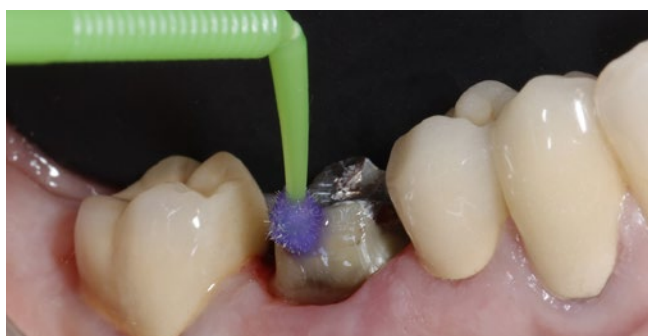
Fig. 4. KATANA™ Cleaner is applied to the prepared tooth structure in the same way (rubbing for ten seconds followed by rinsing and drying).