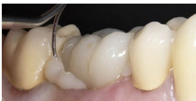
Fig. 7. Easy clean-up after two to five seconds of tack-curing.

The Silane is activated in the mixing tip by Original MDP