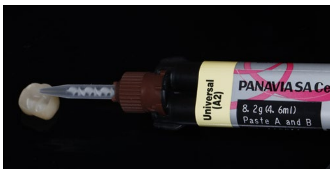
Fig. 5. Application of PANA VIA™ SA Cement Universal into the cleaned crown.