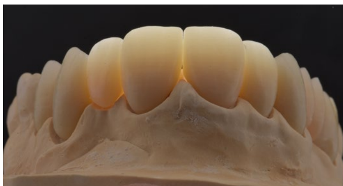
Fig. 3 A light source behind the restorations reveals the incisal translucency.