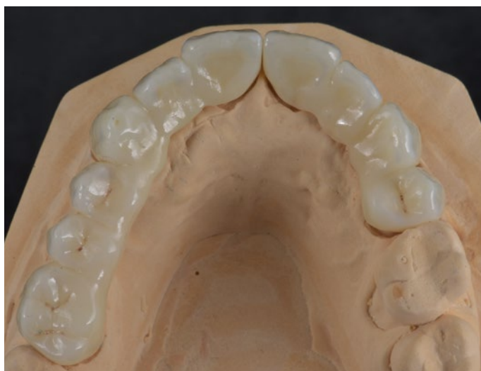
Fig. 7 Occlusal view of the stained and glazed restorations.