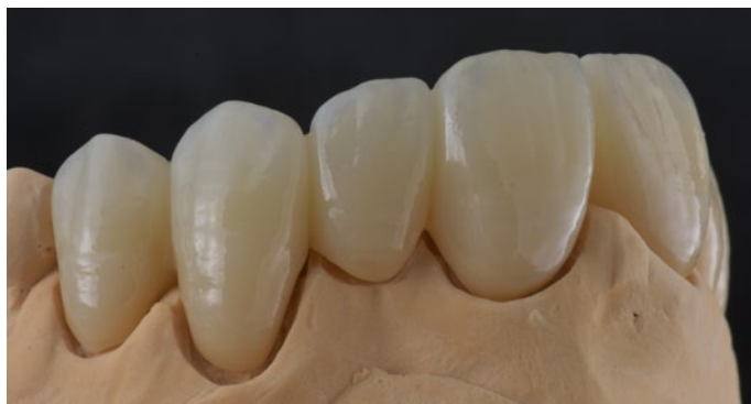
Fig. 9 Buccal view of the finished 4-unit bridge.