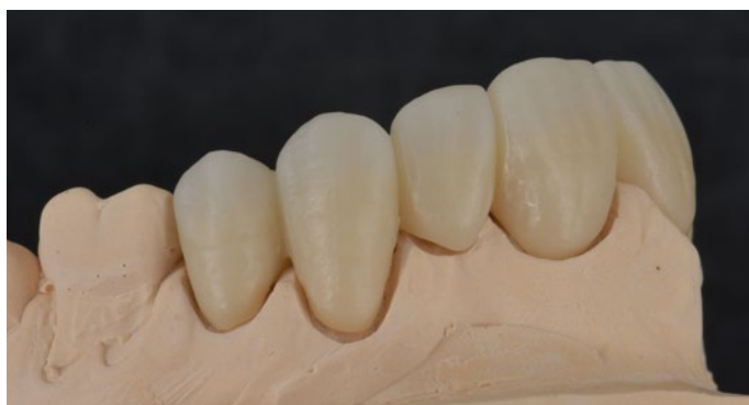
Fig. 4 Buccal view of the 4-unit bridge.