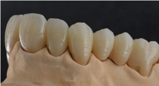
Fig. 10 Buccal view of the finished 6-unit bridge.