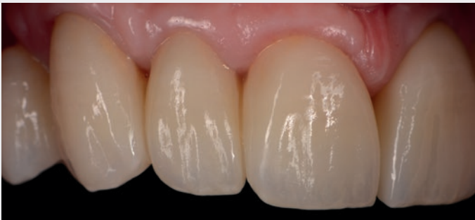
Fig. 12 Buccal view of the 4-unit bridge cemented in the patient's mouth.

With this new type of multi-layered zirconia, it is possible to produce aesthetic monolithic restorations suitable even for use in the anterior area. A high design flexibility is offered despite strength gradation, and the high translucency in the incisal area is responsible for a natural look after sintering. Ultra-micro layering and glazing on the monolithic surface will be sufficient to produce outcomes to our patients' satisfaction.