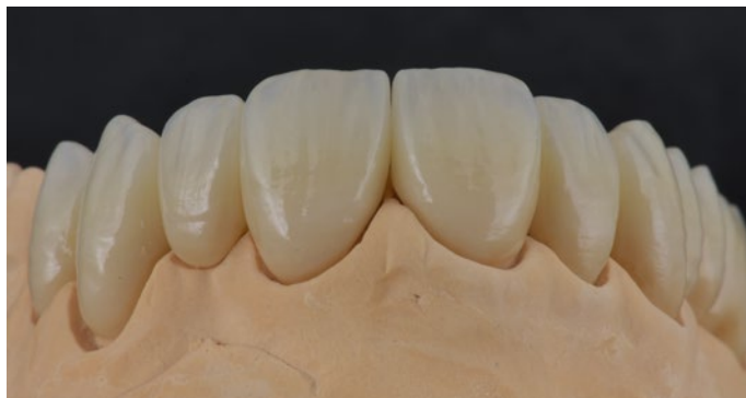
Fig. 6 Frontal view of the two bridges on the model after ultra-micro layering with CERABIEN™ ZR FC Paste Stain (Kuraray Noritake Dental Inc.).