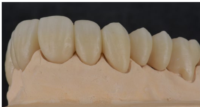
Fig. 5 Buccal view of the 6-unit bridge.