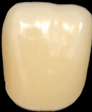
KATANA™ Zirconia HTML PLUS A3