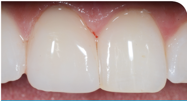
15 End result after rehydration.