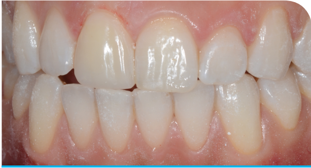
14 End result before rehydration.